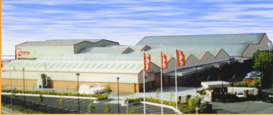
Wednesbury Head Office